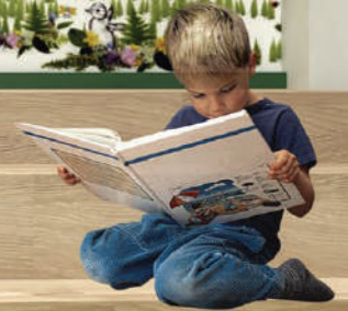
Early Childhood Center Library